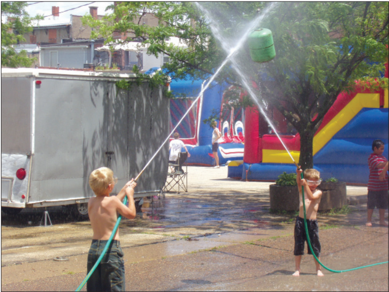
Fun for kids, there will be plenty of free and minimal-fee activities for children in the municipal parking lot behind US Bank.